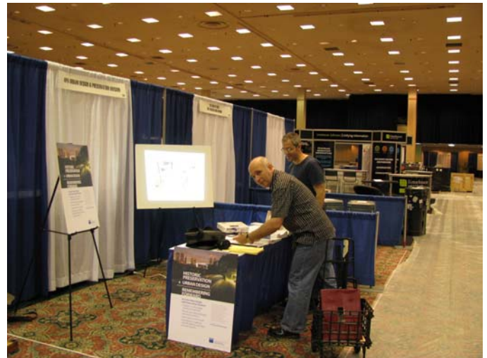
Volunteers set-up the TPD/UD&P Booth at the 2008 APA Conference

TPD would like to thank all the volunteers who helped staff the booth and everyone who stopped by!